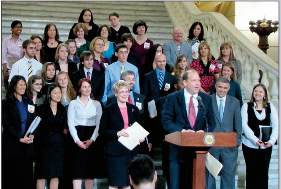
In April, Sen. Leach hosted a bipartisan press conference with Polaris Project to end Human Trafficking.

Leach has worked extensively with the Polaris Project to draft the bill and ensure its passage in the state General Assembly. A representative from Polaris Project said, "Victims of labor trafficking are typically found in domestic servitude, agriculture, nail salons, and even in traveling sales crews selling candy or magazine subscriptions. They face a horrific life in which they are threatened, beaten, raped, starved, locked up, or psychologically tortured. Posting the NHTRC toll free hotline will