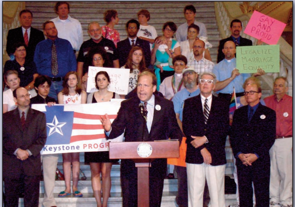
Senator Leach stands with supporters and addresses the media during a press conference for his same-sex marriage bill, SB 935.

I recently introduced legislation that would limit the shackling of pregnant prisoners while they are giving birth. Shackling can be dangerous for the unborn baby, as well as the mother: leg shackles can affect balance, belly restraints can injure a pregnant woman, and wrist shackles can prevent hospital staff from having the freedom of action they need during childbirth. Senate Bill 1074 would allow the shackling only in the most extreme cases of flight risk or potential harm to the public. The Judiciary Committee is currently discussing my proposal.