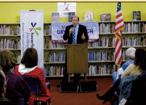
Senator Leach addresses members of the community at a local town hall meeting.