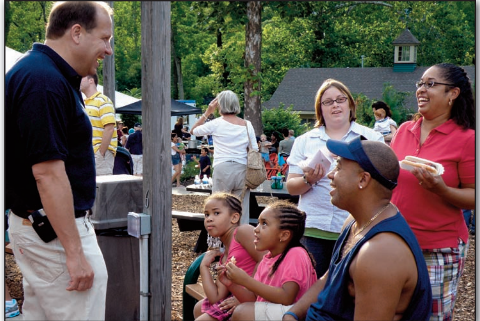
Senator Leach and residents of the 17th District at his first annual Kids' Fair.