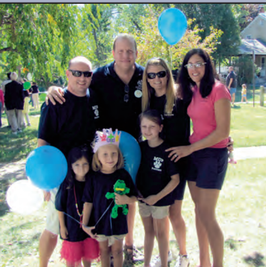
September 11, 2010 – Senator Leach attends Upper Merion Township Community Day and cooks veggie burgers for his constituents.